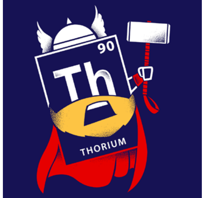
T-shirt design from www.snorgtees.com/thorium

This scepticism is fed by extensive studies, for instance by the governments of the UK and Norway, that were rather pessimistic about thorium. 8,10 For that reason, I still think there are good grounds for hope that false developments towards the introduction of thorium technology may be countered with clear information. Take for example the Canadian company Terrestrial Energy, involved in the development of molten salt reactors, which in 2013 dropped thorium technology and online reprocessing for proliferation reasons, and now works on molten salt reactors based on classical uranium use (Integral Molten Salt Reactor – IMSR).